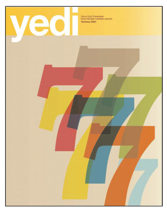
Figure 1. July 2007, Issue 1 Cover

The first cover of the journal, which started its publication life in July 2007, is in the form of a graphic design consisting of seven numbers in the context of identifying the name of the magazine with the identity of the journal (Figure 1). The cover, designed by Tuğcan Güler, reflects the various disciplines within the faculty and the diversity of the article fields to be published in the journal, with its multicolored numbers. At the same time, the name of the journal also represents seven branches of art.