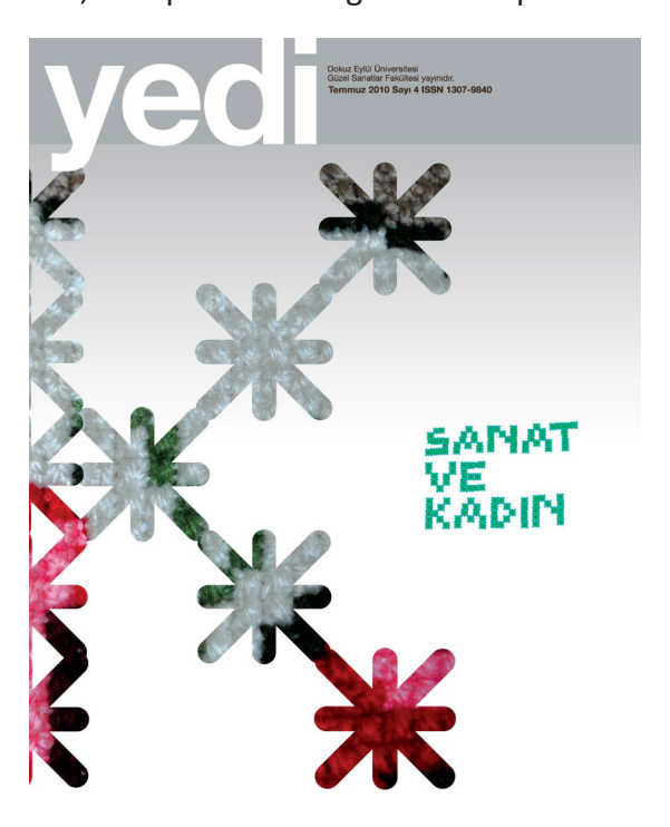
Figure 3. July 2010, Issue 4 Cover

It is seen that the 5th issue of January 2011 is again thematic with the subject of "Critique in Art, Art Criticism" and the cover was prepared by Emre Duygu. In the journal, which was published with the theme of "Critique in Art, Criticism of Art", the words that create a dilemma were tried to be put forward with a design that would create a dilemma in the cover image. In addition, as Duygu expressed, in this design, it was emphasized that "criticism is about the mind rather than the emotions, it requires walking on the steps of the