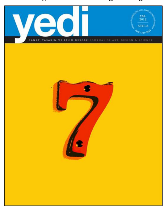
Figure 4. July 2012, Issue 8 Cover

mind". Along with this issue, the "yedi Art, Design and Science Journal" Tübitak Ulakbim Social and Human Sciences Database (SBVT) Committee evaluated and indexed the journal according to the evaluation criteria, and it was decided to monitor the journal in order to see its continuity. At the same time, depending on the change in the faculty administration in 2011, the journal content policy has changed and there has been a tendency from the thematic content approach to the receipt of articles on the subjects of all departments within the scope of the faculty. This understanding manifested itself in the cover design of Öztekin's July 2011 issue. In this cover design, a reference was made to the logo of the faculty, which was designed together