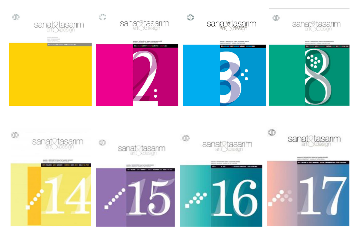
Figure 6. Covers Related to Journal Issue (Art and Design Magazine)

for the design is Betül Uslu Özkan's work called "Dare to Hope" in her personal exhibition. Here, it is the seasonal feature of the winter period that is reflected in the cover design. The design, which resembles snowflakes and evokes the image of winter, consists of words attached to dandelion branches in yellow tone to evoke the feeling of gilding, reflecting the New Year's hopes of the Faculty of Fine Arts. At the same time, a metaphorical understanding emphasizing the spread of conceptually expressed emotional states to the world was displayed by going beyond the area reserved for the cover image.